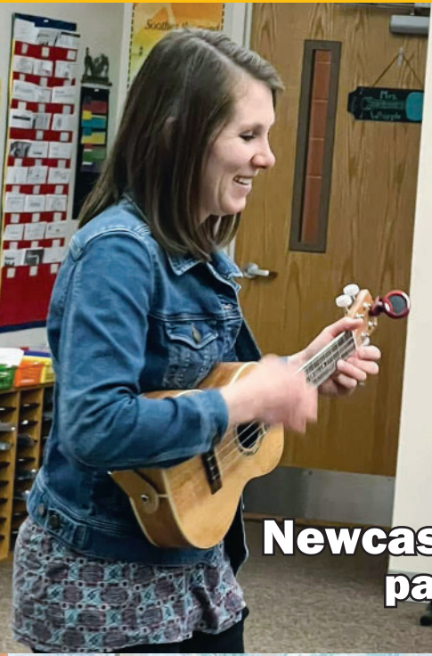
Newcastle Classes page 6-10