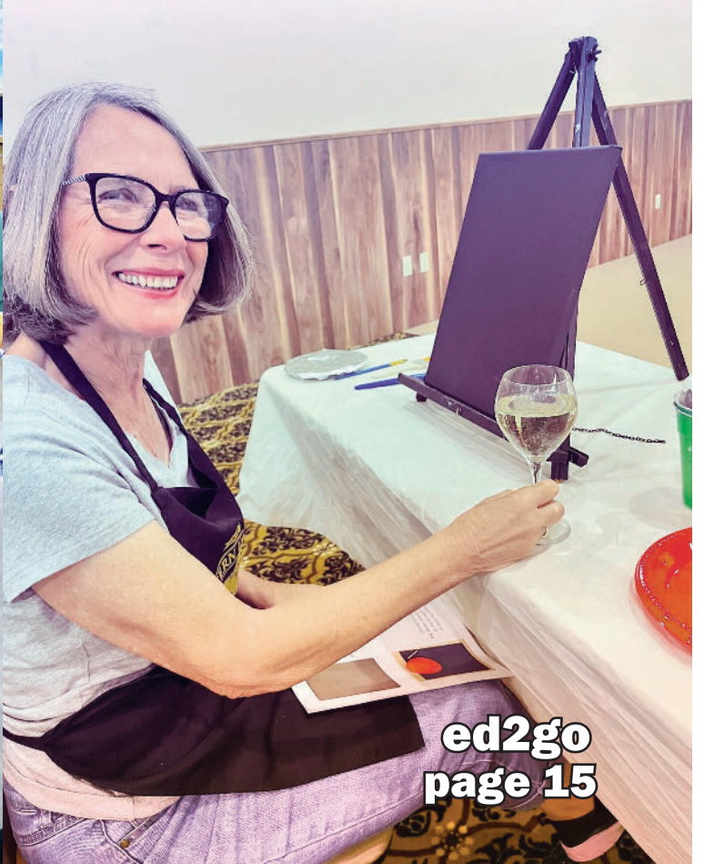
ed2go page 15