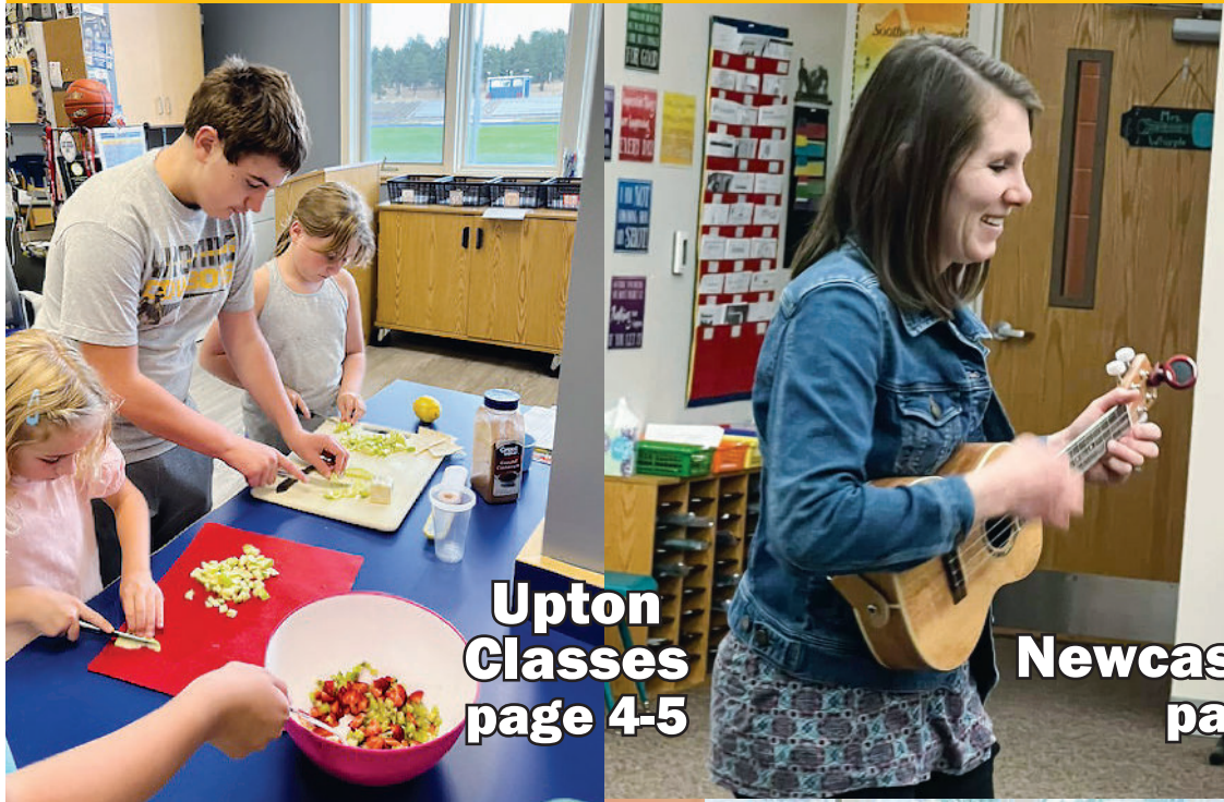
Upton Classes page 4-5