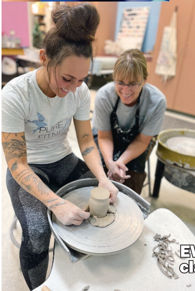
EWC spring online classes page 12-15