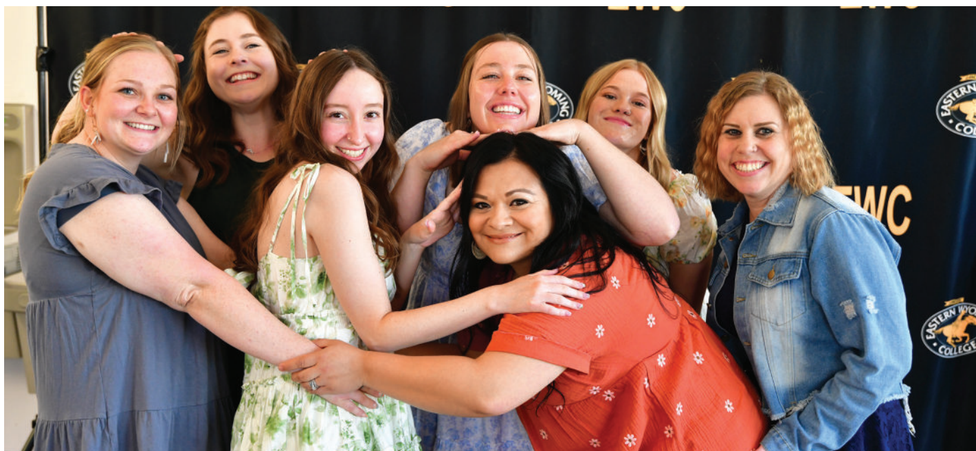
A group of nursing students ready to CHARGE into their future, at EWC's Pinning Ceremony in Douglas, Wyoming May 10, 2025.