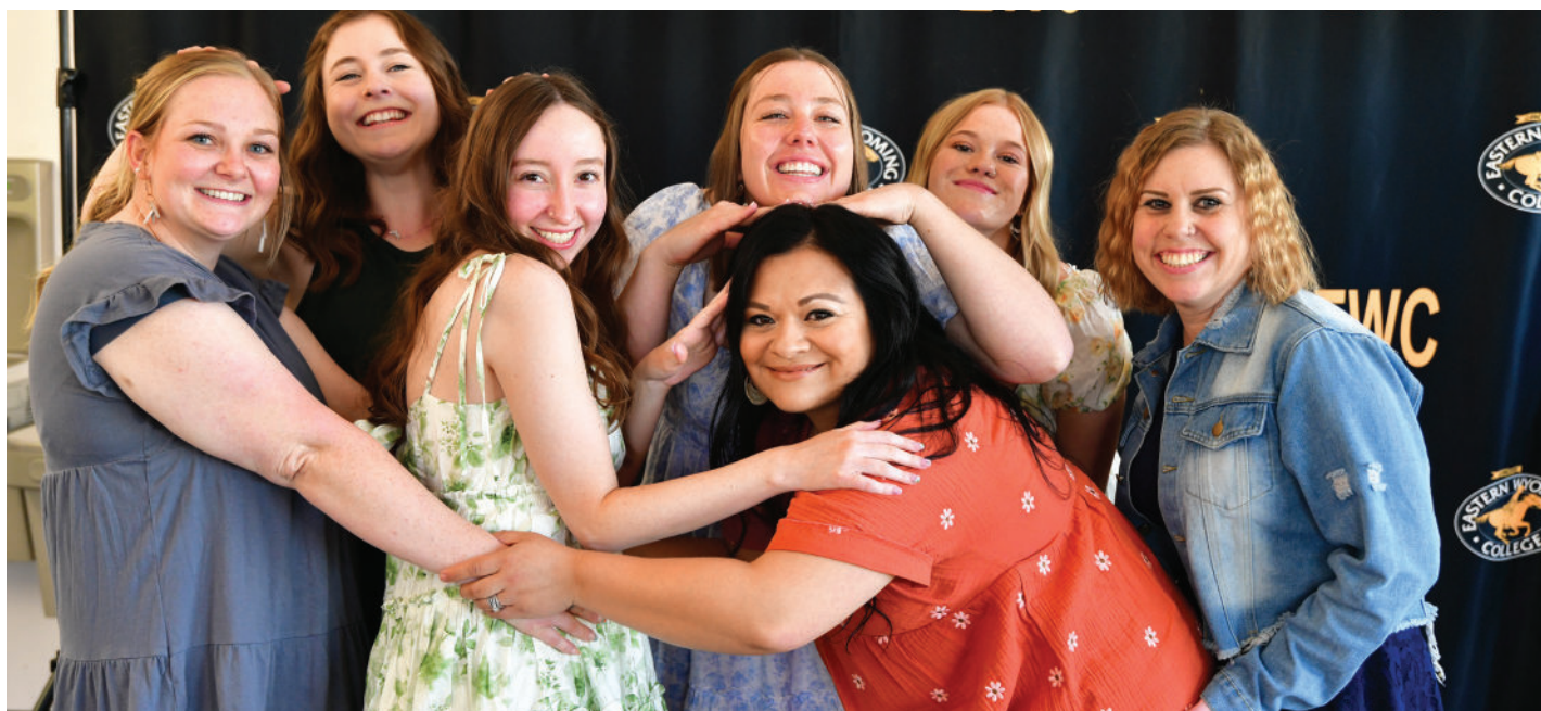
A group of nursing students ready to CHARGE into their future, at EWC's Pinning Ceremony in Douglas, Wyoming May 10, 2025.